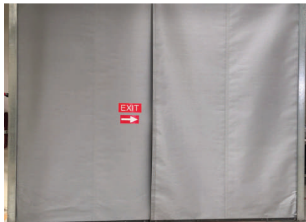
Kent Egress Curtain