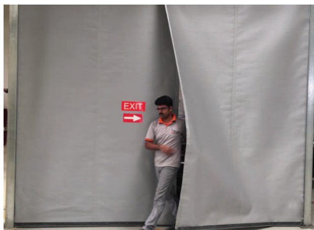
Egress allows safe passage